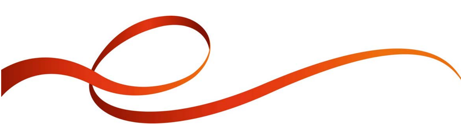
Learning Centre 1