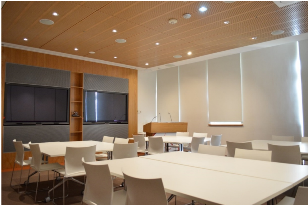
Learning Centre 2